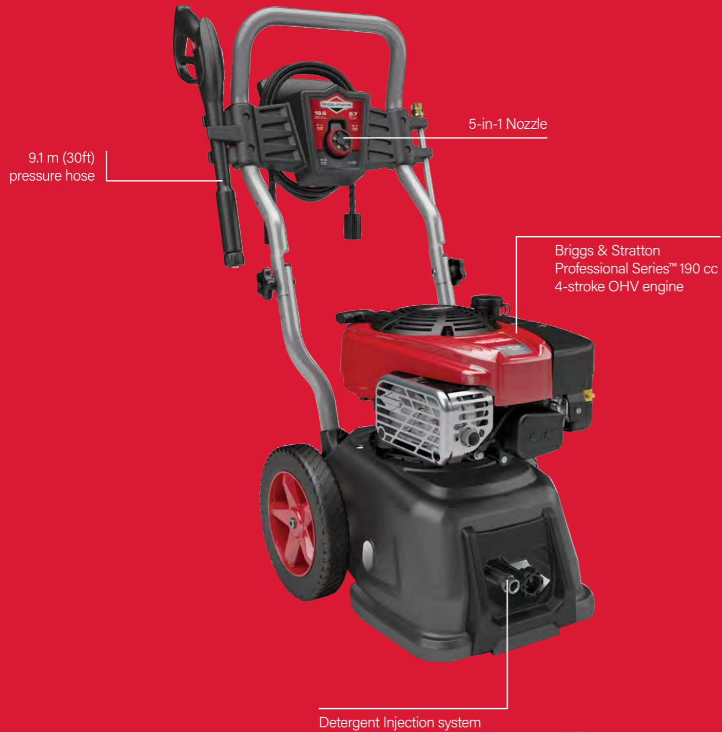
Model Shown: 020636