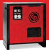
CPRS 327 NS12S