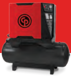
CPRS 6270 B5900B