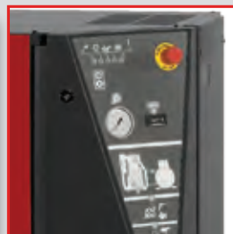
Ease of use

Immediate access to all mechanical & electrical components