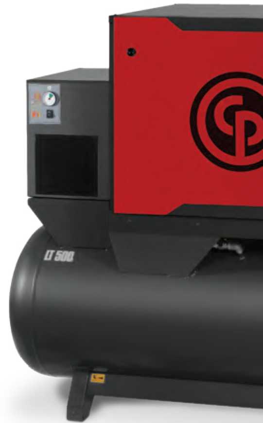
CPRS 10500 B7000