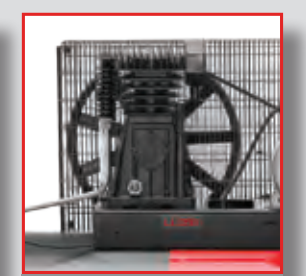
Lower air temperature

Ergonomic and comfortable handling with rubber grips.