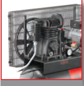
Safe and robust

These belt driven units with a one stage compression are easy and efficient to handle, and they are powerful, performant and reliable at the same time. These units are available in stationary and moveable configurations, and the range includes silenced units for optimal user comfort.